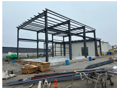
Safety was absolutely top priority for the duration of this project. Communication was also key to the success of this project.