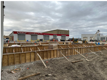
This photo was taken days after the team broke ground in the middle of November.

Please take time to view the photos below showing progress throughout the past four months and let us know how we can be of assistance to your plant.