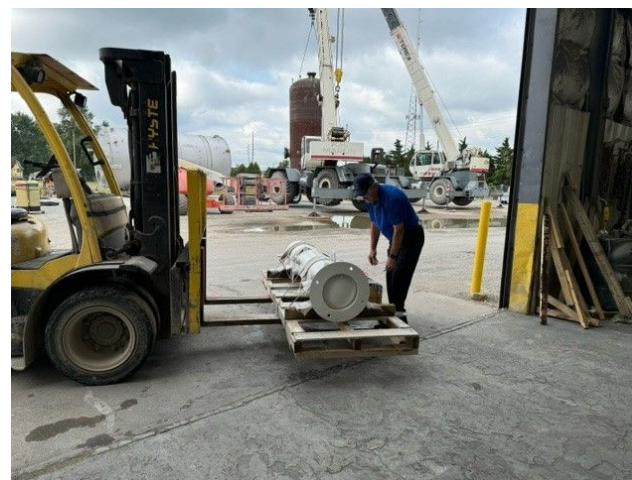
Yesterday, we had another successful customer inspection on a small carbon steel vessel rated for +1480